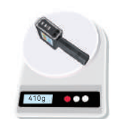
Lightweight and Compact size

Compact design, the whole machine weighs only 410g. Ultra flexible and smooth coding with built-in encoder design.