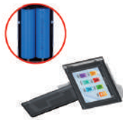
Detachable battery and up to 16 hours ultra long working

One printer for dual use. Take in hand for mobile coding and mount on production line for auto coding.