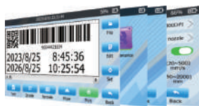
Optimized user interface, easy operation

Compact design, the whole machine weighs only 410g. Ultra flexible and smooth coding with built-in encoder design.